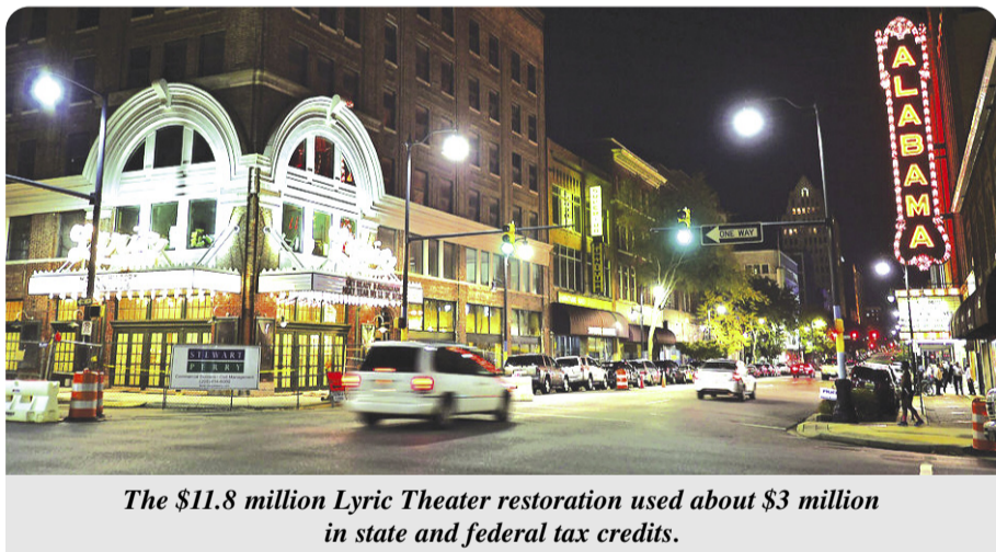
The $11.8 million Lyric Theater restoration used about $3 million in state and federal tax credits.